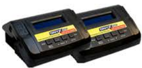
Battery Charger 2-Pack HEPBACH2002