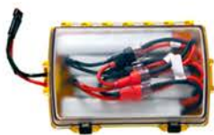
Battery Module HEPBATT1000