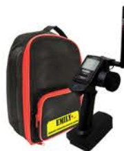
Futaba Transmitter HEPTMBG2000