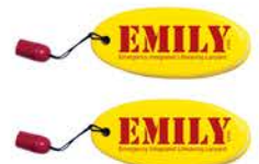
Lanyard 2-Pack HEPFLAN1002